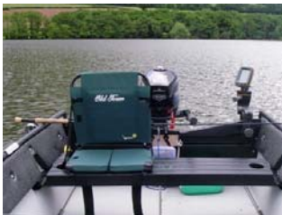
Lightweight, fixed position